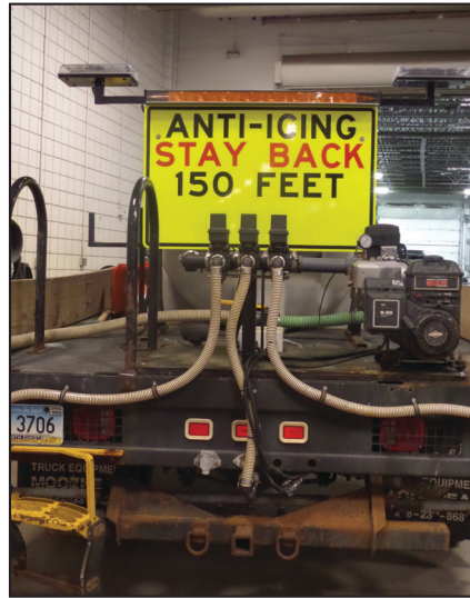
Special trucks are used to spray the anti-ice solution. If you see one, please stay back.

Anti-icing greatly reduces the amount of time required to restore streets to a safe and clear state. It also plays