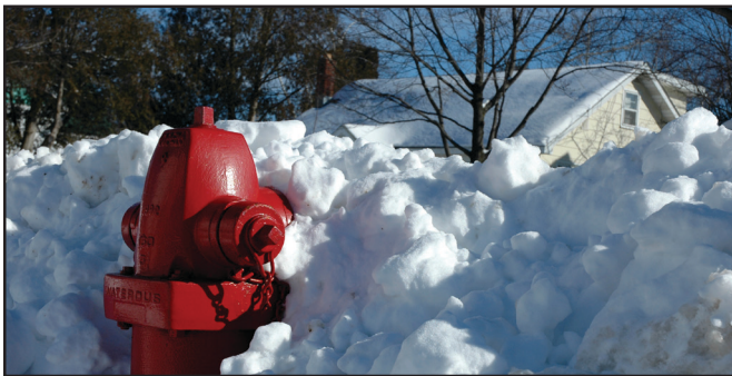
Clear an area three feet in all directions around the fire hydrant.

As snow continues to pile up this winter, it's important to keep an eye on your neighborhood fire hydrant. Please remember that you are responsible for keeping your fire hydrant accessible; clear out an area three feet in all directions around it. This space is necessary for firefighters to connect the proper appliances and hose lines needed to combat a working fire. A buried hydrant will cause the fire department to waste precious time during a fire. A fire hydrant provides protection to the entire block so please pitch in and help elderly or disabled neighbors maintain their hydrants.